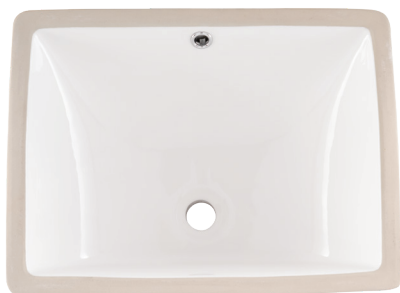
SIN-POR-UNDRECWHT-2015 Outside - 20 3 / 8 " X15 1 / 8 " Inside - 18 1 / 8 " X13" Depth - 7 5 / 8 "