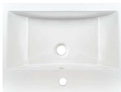
SIN-POR-VOMRECWHT-2417 Outside - 24" X17" Inside - 21" X11" Depth - 7 1 / 2 "