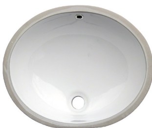
SIN-POR-UNDOVLWHT-1512 Outside - 17" X14 1 / 8 " Inside - 15" X12" Depth - 7 3 / 4 "