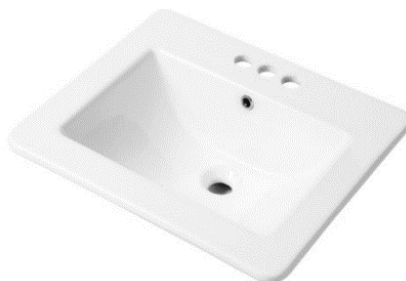
SIN-POR-VOMRECWHT-2118 Outside - 21 1 / 4 " X17 1 / 8 " Inside - 16 3 / 8 " X11 3 / 8 " Depth - 7 3 / 8 "