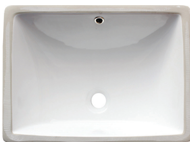
SIN-POR-UNDRECWHT-1813 Outside - 18 1 / 2 " X13 3 / 4 " Inside - 16 1 / 2 " X11 3 / 4 " Depth - 8"