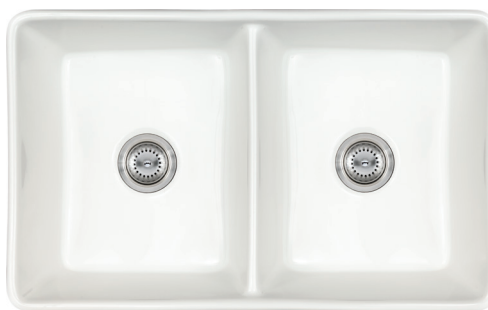
SIN-POR-UDBWH5050-3220FSAF Outside - 31 7 / 8 " X19 3 / 4 " Inside - 14 7 / 8 " X18 3 / 4 " Depth - 8 1 / 2 "