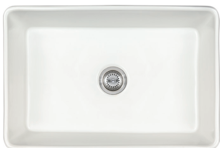
SIN-POR-USBWH-3020FSAF Outside - 30X19 3 / 4 " Inside - 29 1 / 4 " X18 3 / 4 " Depth - 8 1 / 2 "