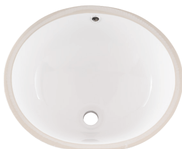
SIN-POR-UNDOVLWHT-1714 Outside - 19 1 / 2 " X16" Inside - 17 1 / 2 " X14 3 / 8 " Depth - 8 1 / 8 "