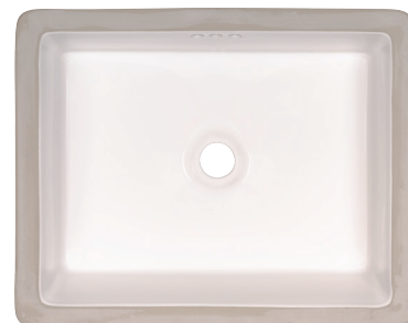
SIN-POR-VURWH-2015FL Outside - 19 3 / 4 " X15 3 / 4 " Inside - 17 1 / 4 " X13 1 / 4 " Depth - 7 1 / 8 "