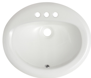
SIN-POR-VOMOVLWHT-2118 Outside - 20 1 / 2 " X17 11 / 16 " Inside - 16" X11 3 / 16 " Depth - 7 7 / 8 "